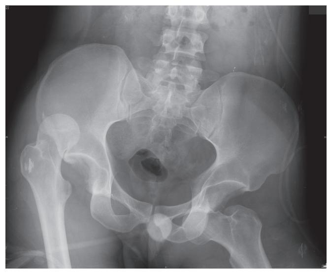
Figure 1.—Plain radiographs of the pelvis.