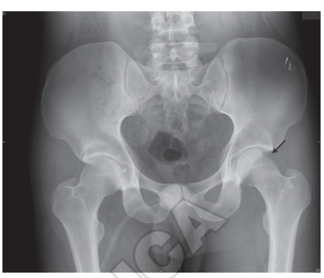
Figure 2.—A Hill-Sachs-type injury on the left side.