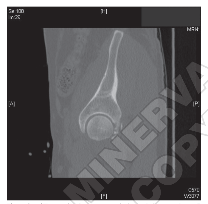
Figure 3.—CT scan showing a non-surgical acetabular posterior wall fracture